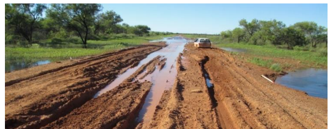
Sturt Creek Crossing impassable during the wet season.

Main Roads is directly managing the Duncan Road and Gordon Downs Road project on behalf of the Shire of Halls Creek, which involves the upgrade of 168km in total. Works include improvements to drainage, as well as pavement construction and sealing. Around 110km of Duncan Road (from Great Northern Highway) and 52km of Gordon Downs Road will be upgraded to connect to the Browns Range Mine Access Road.